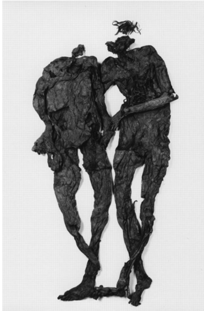
Fig. 1. The “Weerdinge Couple”—two men whose bodies were found in Bourtangter Moor near Weerdinge, the Netherlands, in 1904. The men died approximately 2000 years ago. Drents Museum, Assen.

in 1952 [33]. It was another 20 years before the next two bodies, of Tollund Man and Elling Woman, were to be radiocarbon dated [34]. Until the discovery of Lindow Man, in 1984, radiocarbon analysis was not considered an ideal means for dating bog bodies. This is understandable, because a substantial amount of bone or skin was needed for conventional radiocarbon dating, and museum curators were of course reluctant to sacrifice the necessary samples. Moreover, bog bodies were not a ‘hot issue’ in those days.